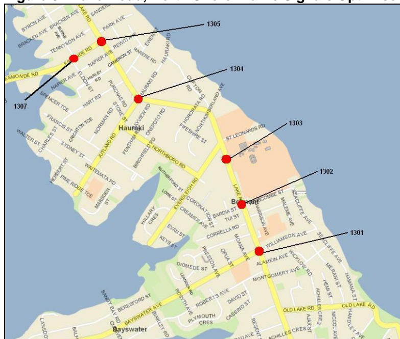
Figure 3 - Lake Road, North Shore Traffic Signals Optimised

The aim of the optimisation project was to ensure the traffic signal operating system (SCATS) and all traffic signal controllers were configured to provide the most efficient traffic flow along Lake Road, without penalising side road traffic.